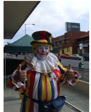
Jimbo the Clown