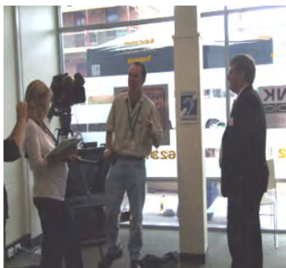
Grant being interviewed by ABC